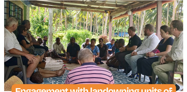
Engagement with landowning units of potential sites.

AirBiz, an international aviation consultancy specialising in airport planning and development, is currently undertaking a feasibility study to assess future aviation needs in Vanua Levu.