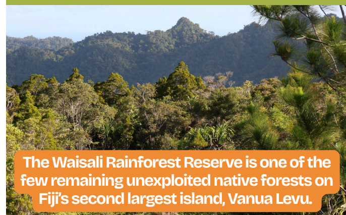
The Waisali Rainforest Reserve is one of the few remaining unexploited native forests on Fiji's second largest island, Vanua Levu.

Planning is progressing to revitalise the Waisali Rainforest Reserve, one of Vanua Levu's most important natural assets, with upgrades focused on improving visitor access, strengthening conservation, and creating local opportunities.