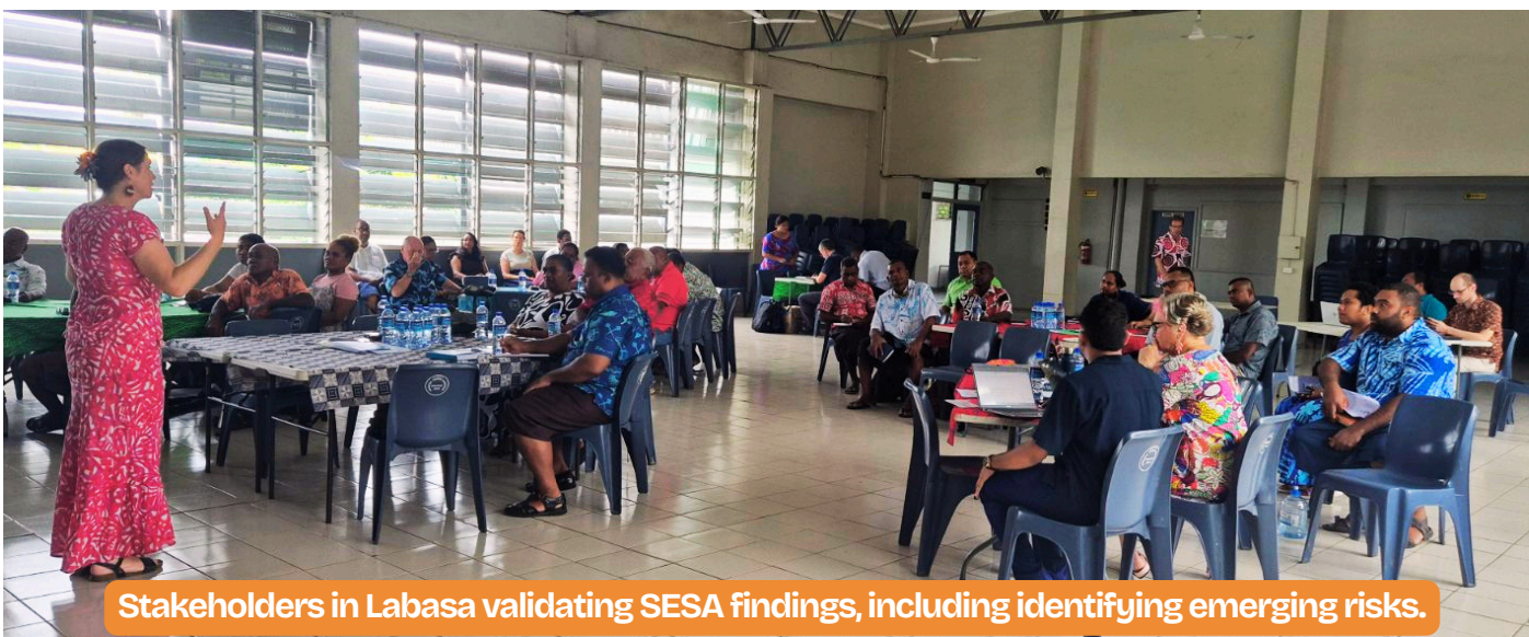
Stakeholders in Labasa validating SESA findings, including identifying emerging risks.

Following the selection of the D&S consultants, the project will move into the design phase, ensuring infrastructure and visitor experiences are aligned with conservation and community priorities.