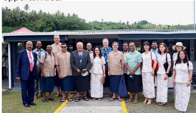
The delegation at Savusavu Airport as they arrived into Vanua Levu to meet communities, business leaders, and visit project sites.