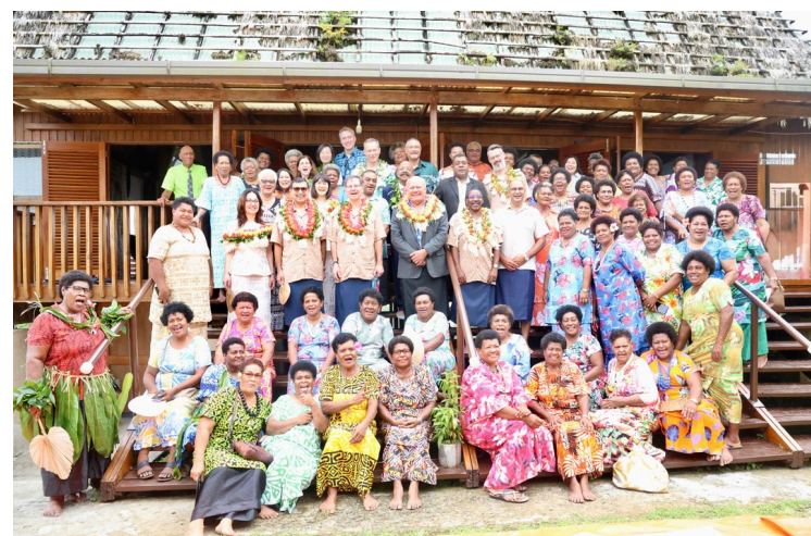
The delegation met with the women of Na I Soqosoqo Vakamarama I Taukei ni Cakaudrove – The Society for Indigenous Women of the Cakaudrove Province