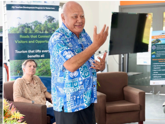
Hon. Viliame Gavoka highlights aviation priorities, reinforcing the importance of safe and reliable air connectivity for Vanua Levu.