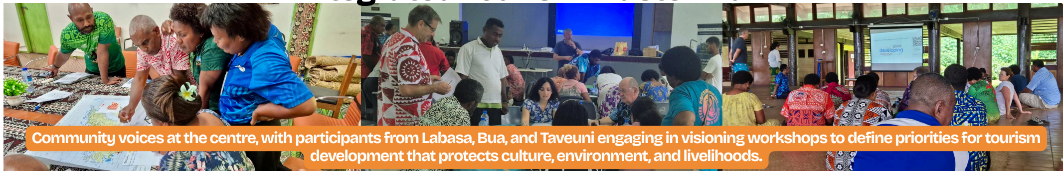
Community voices at the centre, with participants from Labasa, Bua, and Taveuni engaging in visioning workshops to define priorities for tourism development that protects culture, environment, and livelihoods.

The Integrated Tourism Master Plan (ITMP) is progressing steadily, with baseline analysis completed and visioning workshops held across the Northern Division.