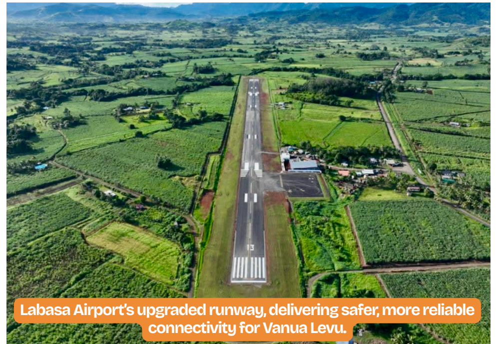
Labasa Airport's upgraded runway, delivering safer, more reliable connectivity for Vanua Levu.

"The Na Vualiku Project reflects the Coalition Government's commitment to securing and advancing major development financing for Vanua Levu. Through this program, we are pursuing practical investments that can strengthen infrastructure, improve access, and support long term tourism and economic development.